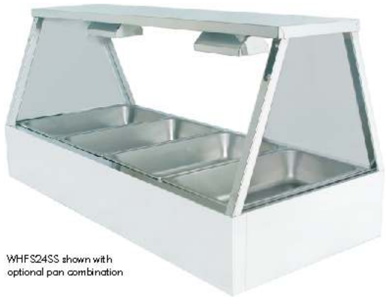
WHFS24SS shown with optional pan combination