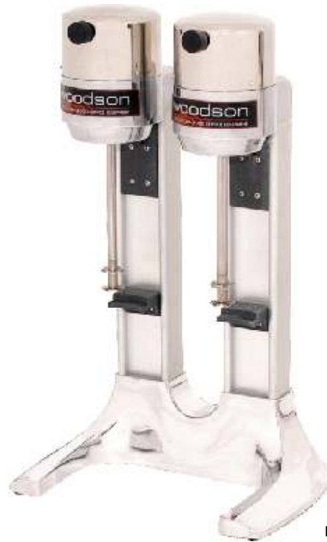
Model WMSB02V shown

Power Supply located on back right hand side of each benchtop unit